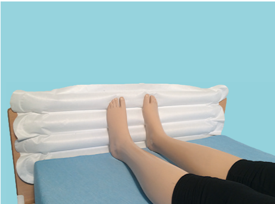
All Up Produktablaide 2026 v1 (Foot Sole EN)