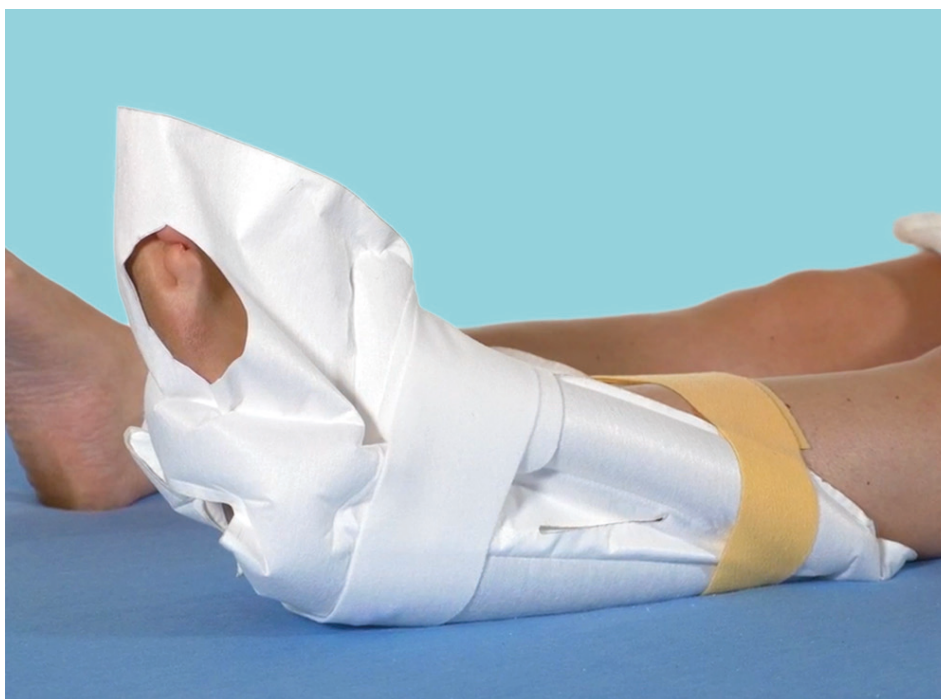
Heel up Produktdatablad 2026 v1 (CUT Medium EN)