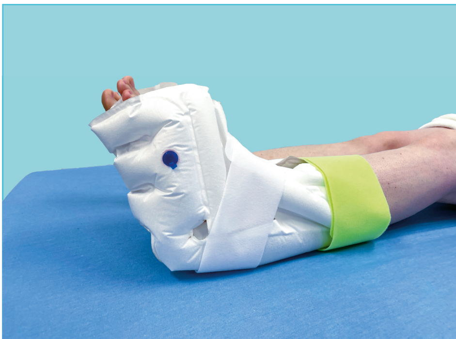
Heel up Produktdatablad 2026 v1 (FIX Short EN)